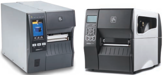
Zebra ZT411 and ZT230

The Zebra ZT230 offers reliable printing for a wide variety of applications. It is designed for ease-of-use where higher volume printing is required.