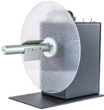
Labelmate UCAT-1 Unwinder

Label Unwinders provide a convenient way to manage your supply roll of labels as it feeds into a printer. Using larger rolls of labels to minimise your unit label cost means the supply label roll does not have to be refreshed as often, saving time and adding convenience. External label rolls are always visible, making it easy to monitor the status of your label supply.