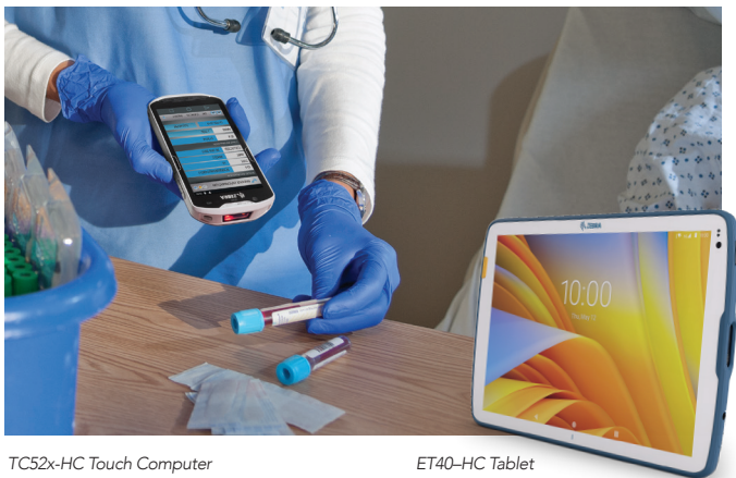
TC52x-HC Touch Computer

Instantly with the TC52x-HC Touch Computer and the ET40-HC Healthcare Tablet