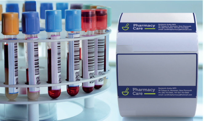
Laboratory and Pharmacy Labels

Blank Labels, Barcodes, Sequential Numbering, Dispensary Labels, Cryogenic and Laboratory Labels